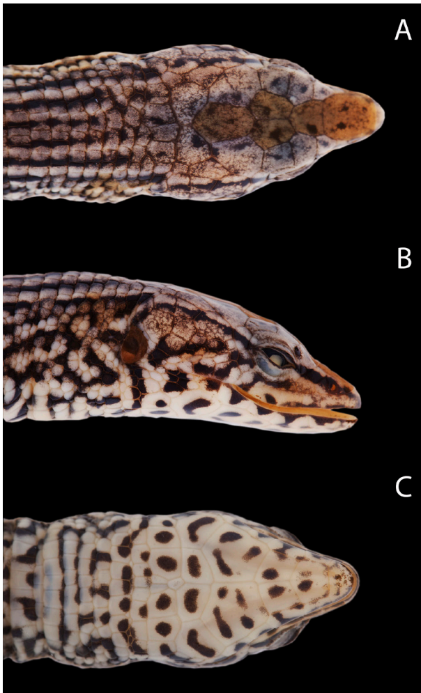
Fig. 2. Dorsal (A), lateral (B), and ventral (C) views of the head of Petracola angustisoma sp. nov. Holotype, CORBIDI 00467, male.

supraoculars. Interparietal hexagonal. Parietals polygonal, longer than wide. Postparietals two, with posterior sutures forming a nearly straight line. Supraoculars two. Anterior supraocular larger than posterior supraocular. Superciliary series discontinuous, 2-1/2-1, the anteriormost extending onto dorsal surface of head. Nape scales immediately posterior to head scales larger than adjacent dorsals. Nasal subtriangular, pierced in center by nostril, with shallow groove extending dorsally to loreal. One loreal on each side, not in contact with supralabials. Palpebral disc transparent with minute brown flecks. Supralabials eight. Suboculars three. Postoculars two. Supratympanic temporals 3/3. Tympanum recessed, transparent. Infralabials six. Genials two, meeting at broad midventral sutures. Pregulars in somewhat regular transverse rows, anteriormost two rows larger than posterior rows. Gulars in eight rows. Gular fold distinct, concealing three rows of small scales.