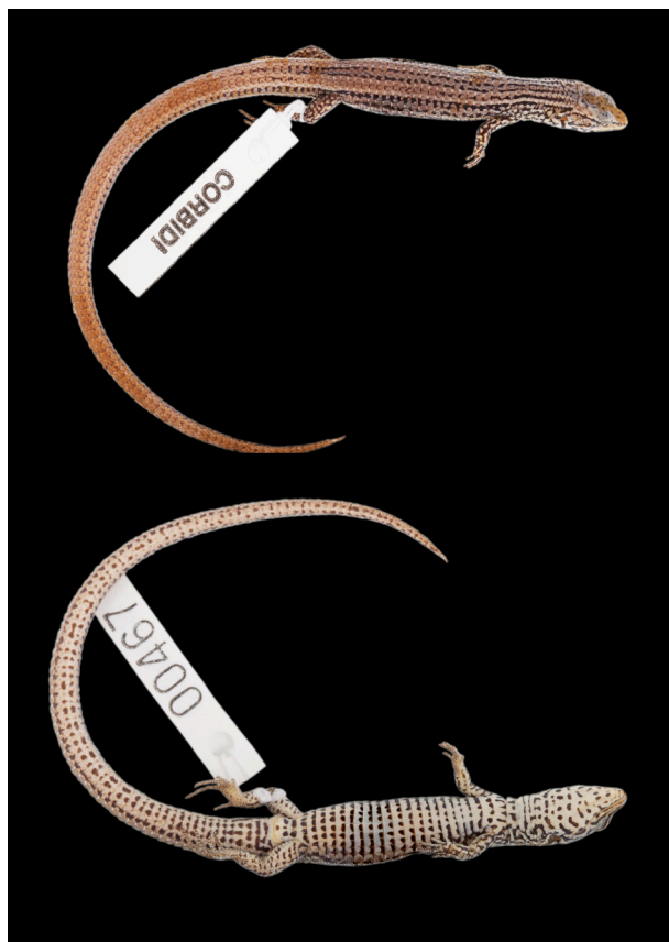
Fig. 1. Petracola angustisoma sp. nov., holotype CORBIDI 00467, male, 43.6 mm SVL. Dorsal (upper) and ventral (bottom) views.

Description of holotype: Rostral scale wider than long, taller than adjacent supralabials, in contact with frontonasal, nasals, and anteriormost supralabials. Frontonasal longer than wide, widest at level of nares, distinctly larger than frontal. Frontal approximately as long as wide, widest at anterior suture of anteriormost supraocular, barely extending between frontoparietals. Frontoparietals hexagonal, in contact medially and with