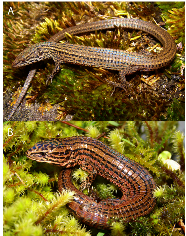
Fig. 3. Two species of Petracola in life. Holotype of P. angustisoma sp. nov. (A), and adult male of P. ventrimaculata (CORBIDI 03630) from Laguna Norte, Cajamarca (B).

Dorsals smooth, juxtaposed, rectangular, in 37 transverse rows and 19 longitudinal rows (at tenth transverse ventral scale row). Ventrals smooth, in 22 transverse and 10 longitudinal rows. Dorsals and ventrals separated by