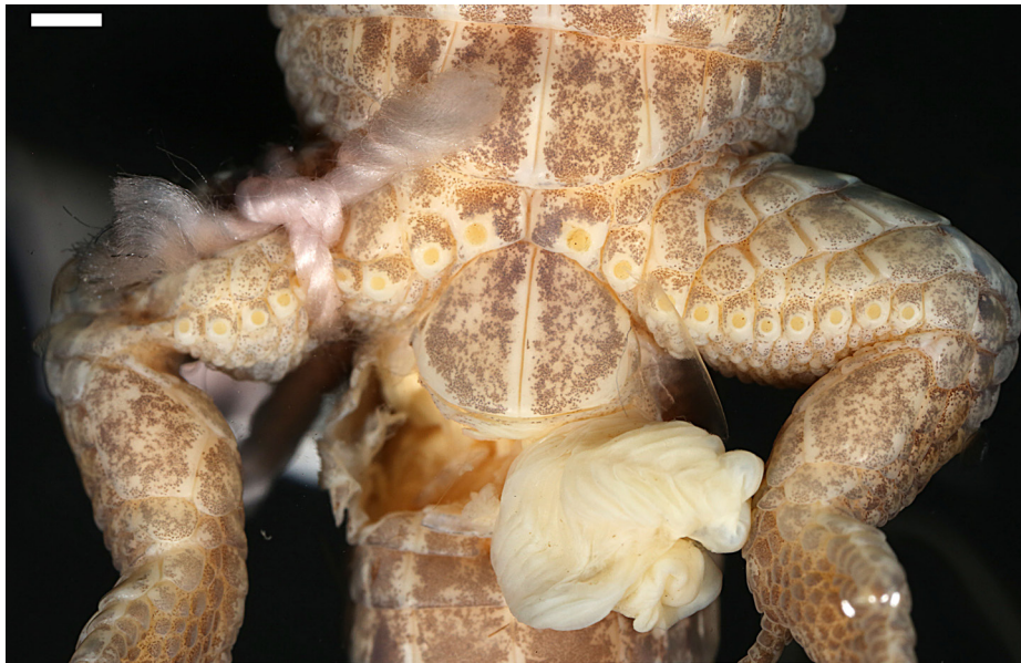
Fig. 6. Ventral view of waist of Petracola labioocularis (paratype, SMF 80113) showing the preloacal and femoral pores. Scale bar = 1 mm.

Amorós CL, Guralnick RP. 2013. Finding arboreal snakes in an evolutionary tree: phylogenetic placement and systematic revision of the Neotropical bird-snakes. Journal of Zoological Systematics and Evolutionary Research 52(3): 257–264.